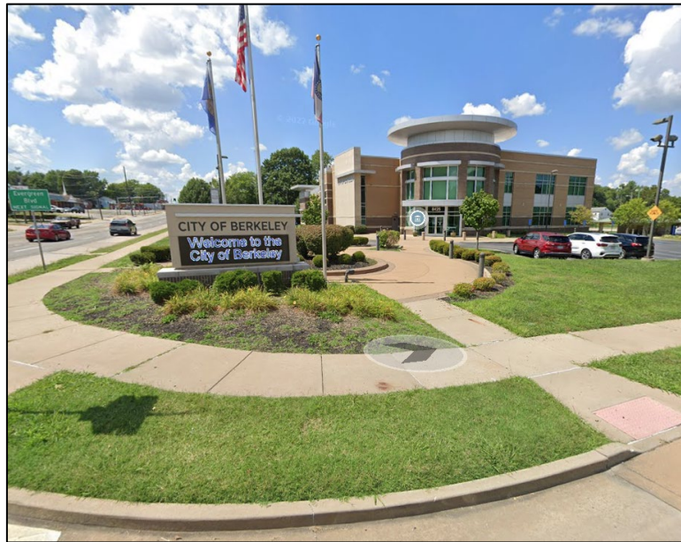
Front view of lot.