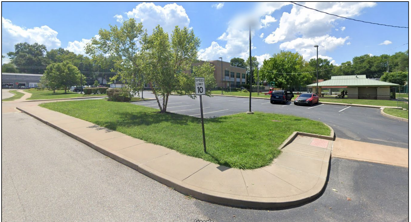
Rear view of lot.