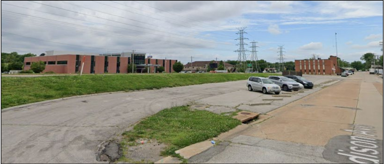
Looking north to Airport and Hanley Roads