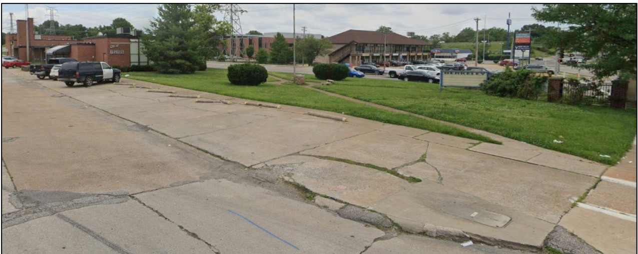
Looking south from Airport Road and Madison Avenue