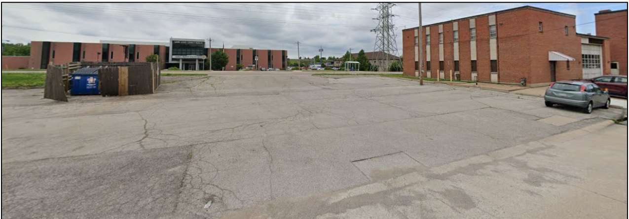
Center section showing dumpster enclosure